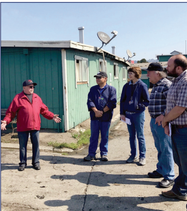
CONFORMATION CLINIC GOLDEN GATE FIELDS Saturday, March 24 Registration Opens February 24