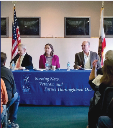
TAX PLANNING SEMINAR GOLDEN GATE FIELDS Saturday, February 10 Registration Opens January 10