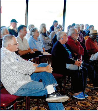
TOC MEMBER Q & A: Entries & Carding Races GOLDEN GATE FIELDS Sunday, January 21 Registration is now open