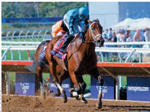
Two-time Breeders’ Cup Sprint winner Roy H in his Del Mar victory